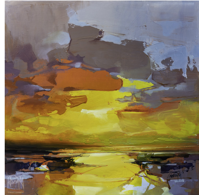
Scott Naismith—'Clarity in Chaos'

06/12/22 10:27-47 The Spirit goes to the Gentiles 06/19/22 11:19-30 Snapshot of the Church 06/26/22 14:8-23 Message Goes Out 07/03/22 15:1-11 Fine Tuning the Message 07/10/22 16:1-19 How the Msg Changes Lives Pt 1 07/17/22 16:20-40 How the Msg Changes Lives Pt 2 07/24/22 17:16-34 Paul @ Mars Hill 07/31/22 19:23-41 Idolatry